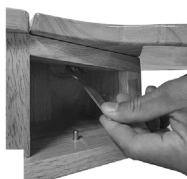
2. USING BOLT AND WASHER, ATTACH RIGHT AND LEFT ARM RESTS TO DESK