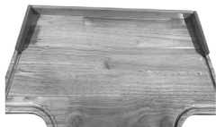
4. GENTLY INSTALL SIDE AND REAR GUARDS