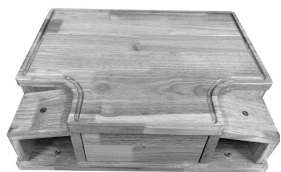
1. REMOVE TWO SMALL SIDE DRAWERS