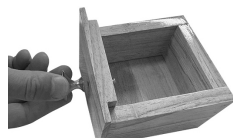
3. USING BOLTS, ATTACH DRAWER HANDLES TO DRAWERS