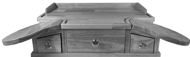
5. ASSEMBLED MINI WORK BENCH